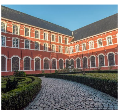
from the city centre.